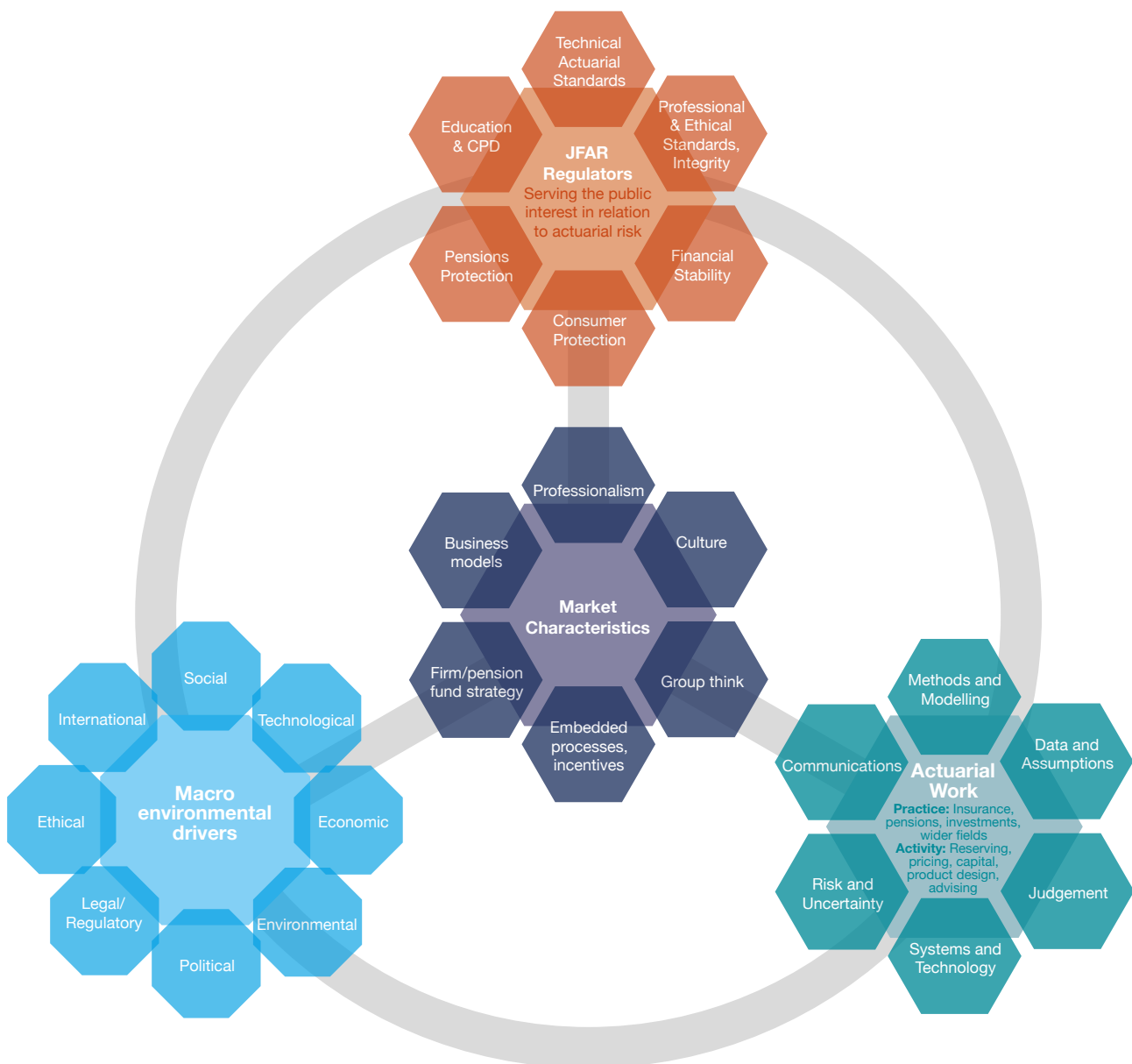
Figure 2: Actuarial Risk Identification Architecture

The ARIA has helped the JFAR to review and capture the interactions between the various drivers and sources of risk. For example, a macro environmental driver such as improving technology (Big Data), may impact the work of actuaries (using machine learning) and the characteristics of the market (new on-demand insurance products). The interaction of these factors may either increase or decrease the risk to the public interest through the change in the availability or price of suitable insurance products.