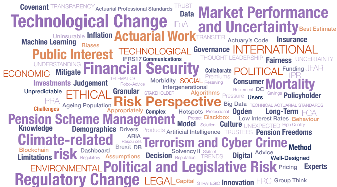
Figure 1: Risk Perspective: 2017 Update Hotspots

In this report, for each hotspot, the risk is described in generic terms and the key risk drivers and current influences that lead to its definition as a hotspot are identified. Within each description the JFAR identifies possible responses that actuaries or users of actuarial work may wish to consider. Readers of the report may also wish to refer to the external sources of information that were used in the production of this report; these are referenced at the end of the report.