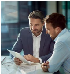
Financial wellbeing in the workplace A summary of the Aegon and Centre for Economics and Business Research report

Two summary documents were produced for you as a useful resource when considering the challenges your employees could be facing: