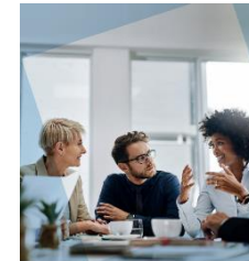
Financial wellbeing in the workplace A summary of Aegon's research into employee views

We also produced a summary of research carried out by YouGov amongst employers exploring their views on financial wellbeing in the workplace.